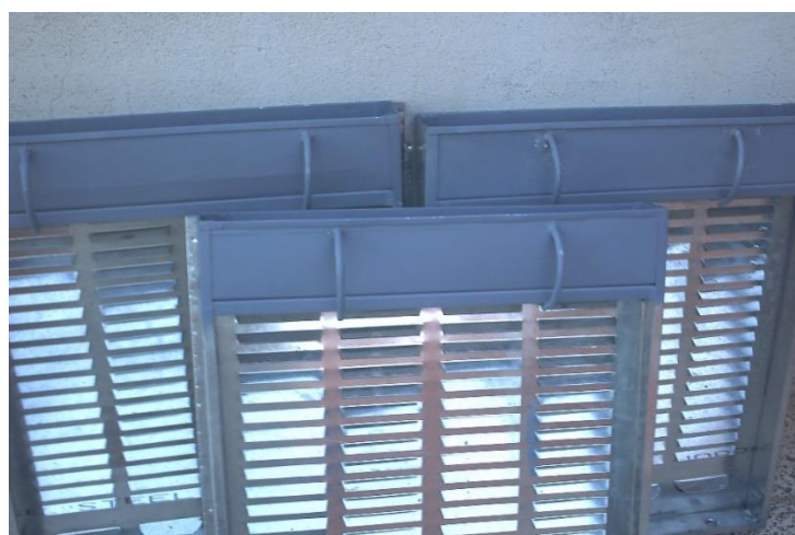
Figure3. The proposed evaporator windows