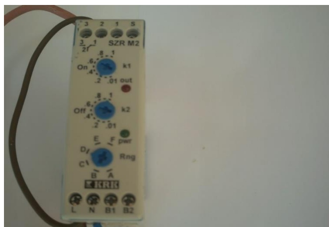
Figure 2. The timer