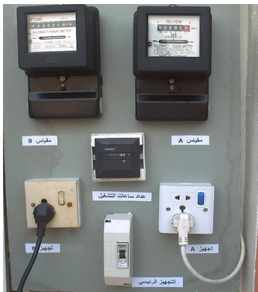
Figure 4. Two home meters A and B to compare the energy consumption of the proposed and the conventional air conditioner.