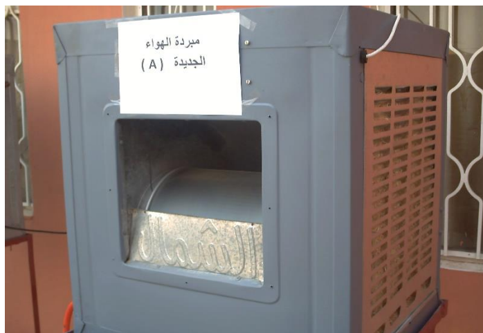
Figure 1. The evaporator air cooler.